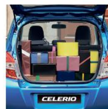
Versatile Carrying Capacity