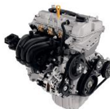
1.0 Liter, 3 Cylinder DOHC 12V Engine