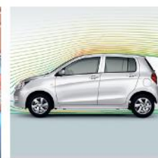
Aerodynamically Designed for Better Fuel Efficiency