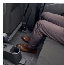
Spacious Legroom and Higher Headroom