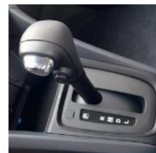
CVT Transmission for CVT Variant