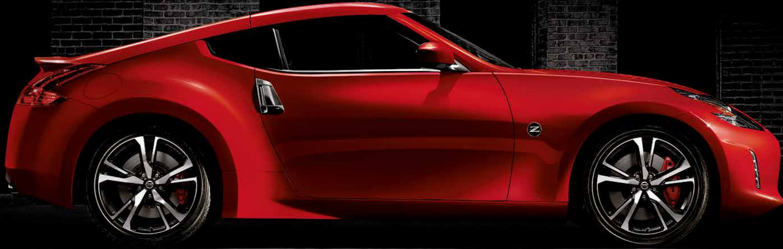
Nissan 370Z® Premium shown in Vibrant Red

Every drive is something special. The battle cry of a legendary 332 Ps VQ V6 paired with the world's first rev-matching manual transmission. The relentless cornering grip of a dynamically balanced chassis talking to you through a driver-focused cockpit. The Nissan 370Z. This is tech that moves you.