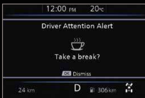
Driver Attention Alert