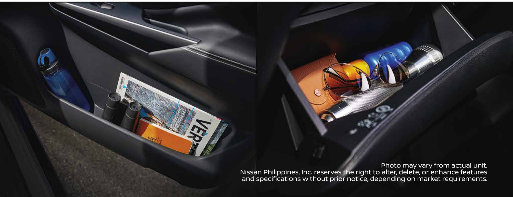
Photo may vary from actual unit. Nissan Philippines, Inc. reserves the right to alter, delete, or enhance features and specifications without prior notice, depending on market requirements.

Life can be messy, but the Navara is designed to bring order in the truck. Tuck away things with a high-capacity glove compartment, a roomy center console, and dedicated storage under the climate control. Keep your electronics charged up with accessible USB ports. You can also see Nissan's innovation in every section of the Navara. Even the cupholders are multifunctional. Perfectly shaped for your drinks, dog treats, and your gadgets.