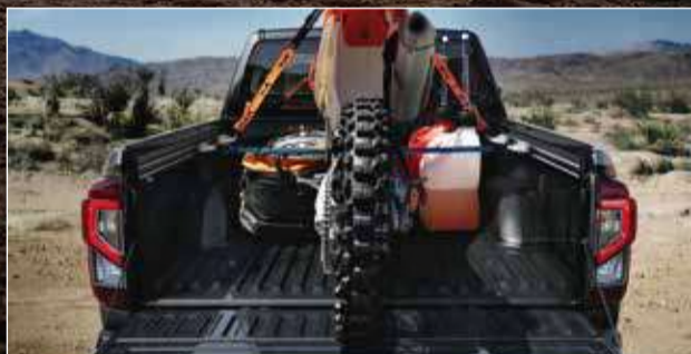
Photo shown with optional bed liner accessory.